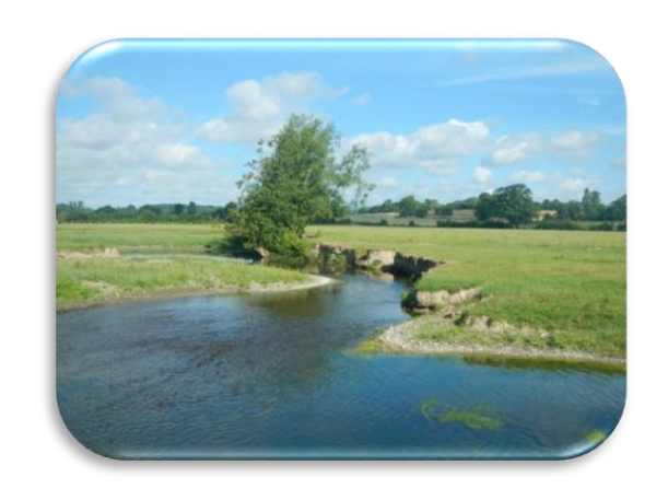
A sunny stretch of the River Arrow

The Wye pilot will use fencing alone to allow the natural regeneration of local species, such as alder and willow, protected from grazing cattle. This will have the additional benefit of reducing another major pressure on salmonid populations, sediment levels downstream, by preventing stock access, sealing off drinking points and creating effective buffers from arable operations. Stock watering is being put in place to allow access to drinking water for cattle which would previously have drunk from the river.